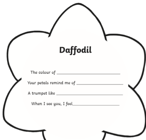
Spring Shape Poem 1